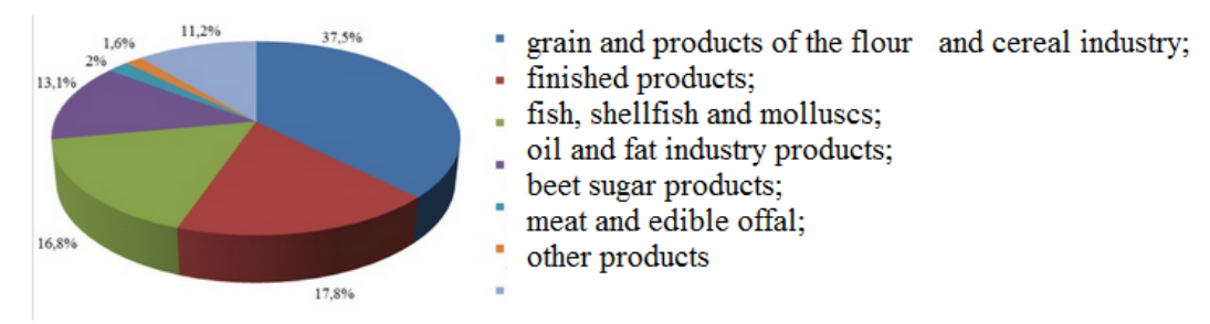
Fig. 2 Export structure of agricultural products for 2018

In the general export structure, the main product groups are grain and products of the milling and cereal industry, ready-to-eat products, fish and hydrobionts, products of the oil and fat food industry, meat and meat products (Figure 2).